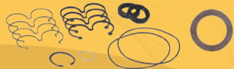
PUMP SEAL KITS